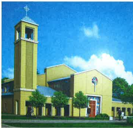
Artist's rendering of the new proposed St. Cecilia Catholic Church building to be completed in 2011.

Holy Cross, for example, was formed in 1956 with about 285 people, according to its pastor, Father Tim Gollob. Parishioners have worshipped since that time in the school cafeteria, and extended its programs